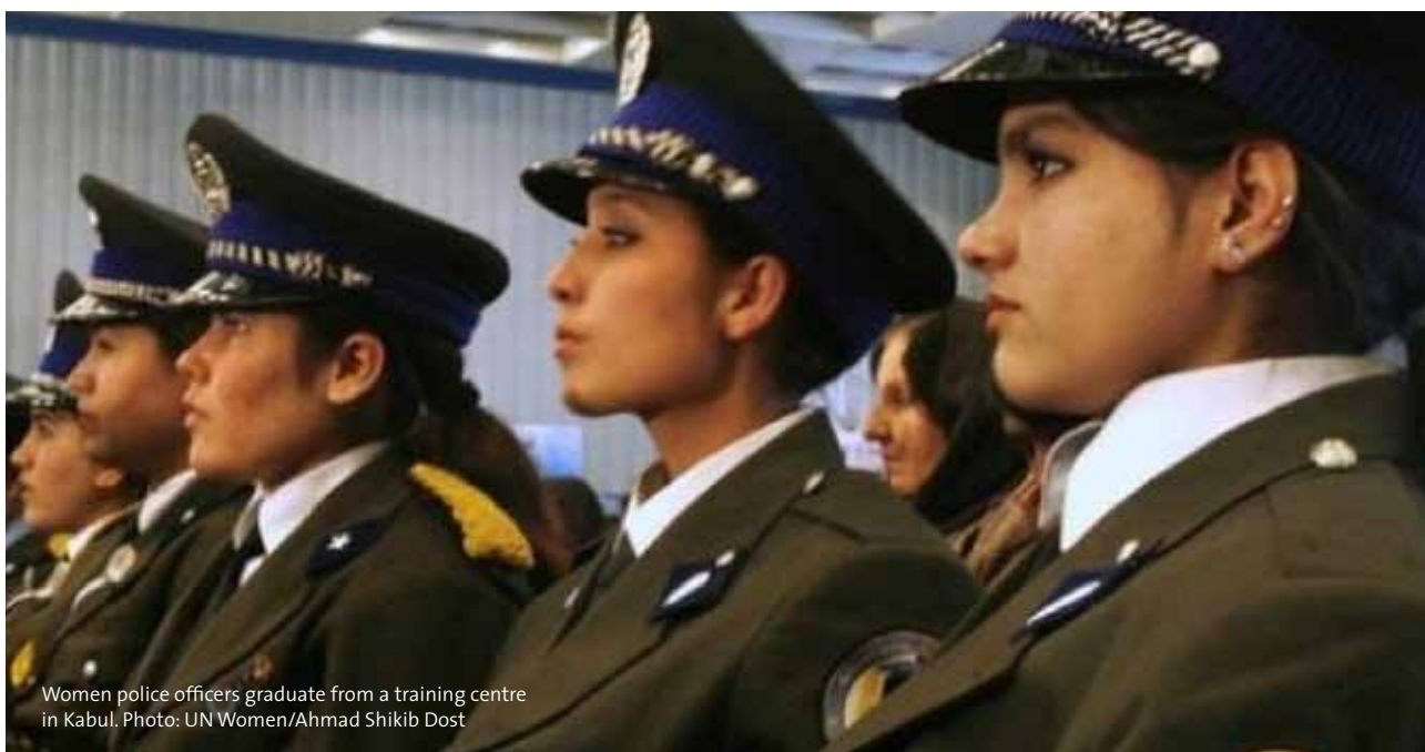
Women police officers graduate from a training centre in Kabul.