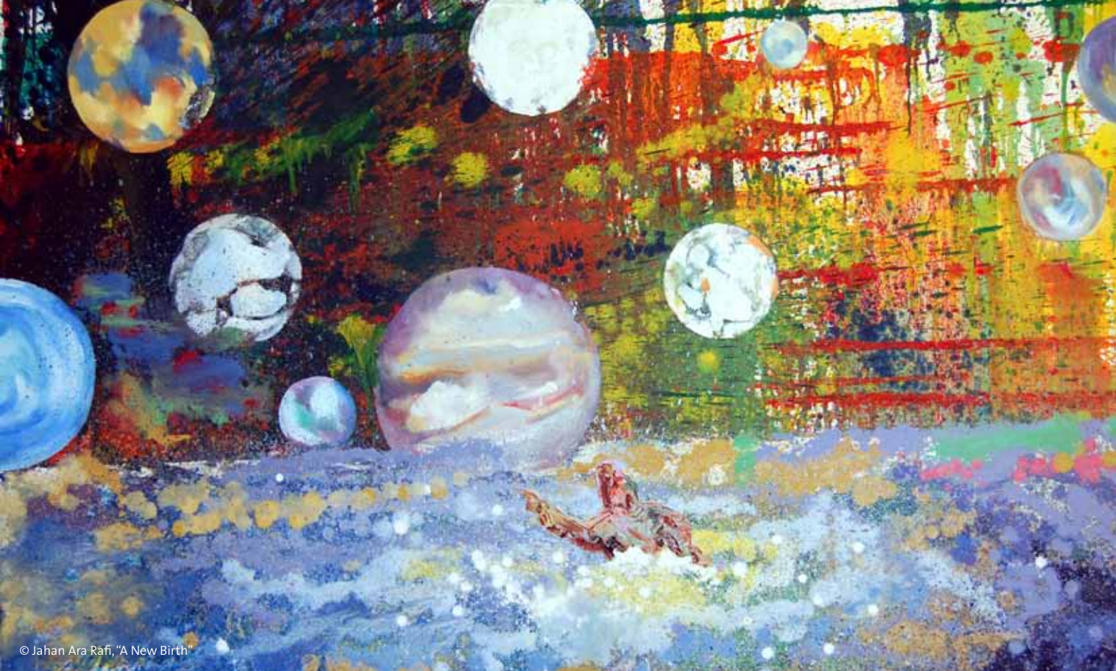
"A New Birth"