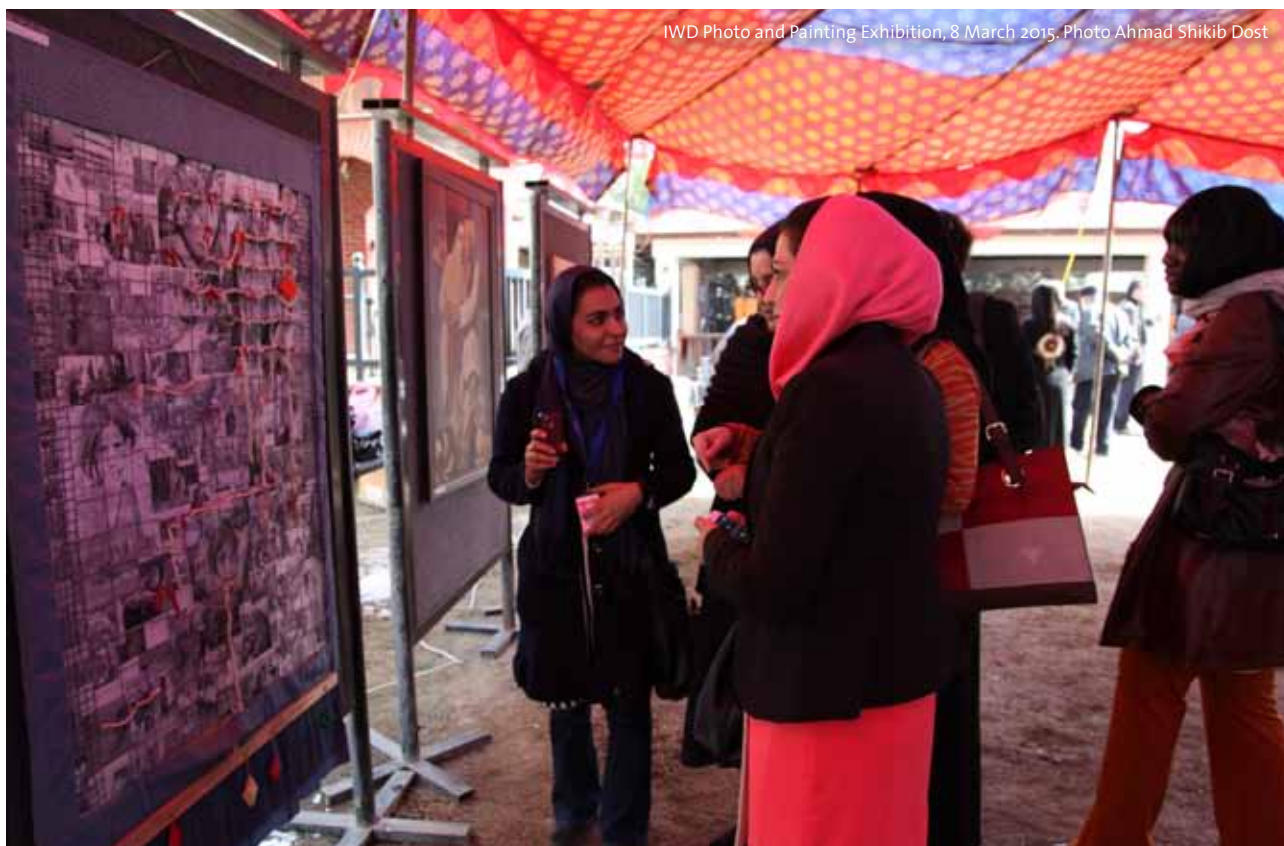
IWD Photo and Painting Exhibition, 8 March 2015.

While recognising that there will be a total change of government, and a concomitant change of attitudes and the need for new engagement, the ACO assumes that the overall commitment to the TMAF, NAPWA, ANDS and international obligations will be retained and respected by the new government.